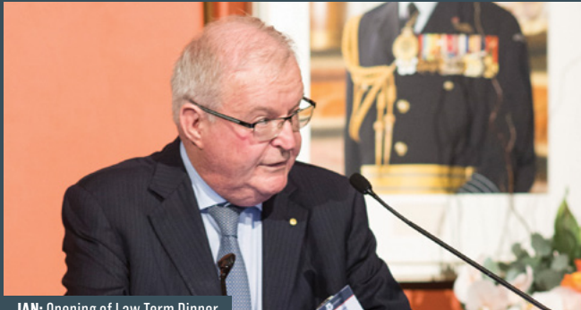
JAN: Opening of Law Term Dinner