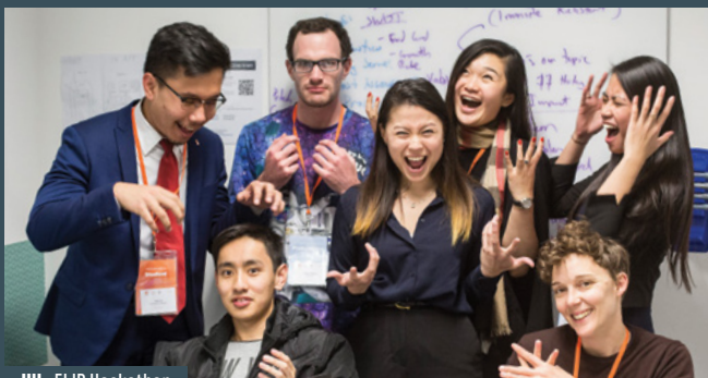
JUL: FLIP Hackathon