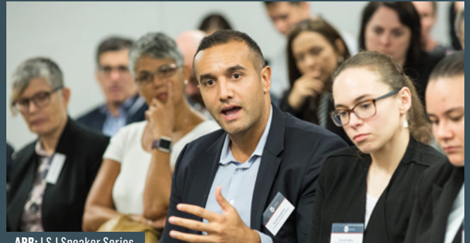
APR: LSJ Speaker Series