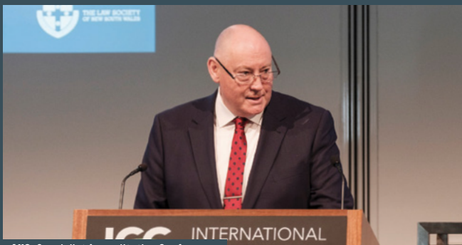
AUG: Specialist Accreditation Conference