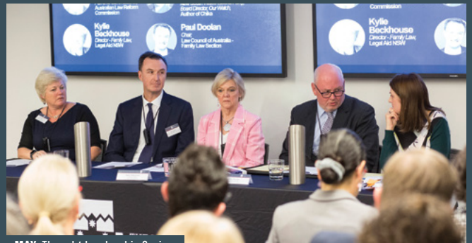
MAY: Thought Leadership Series