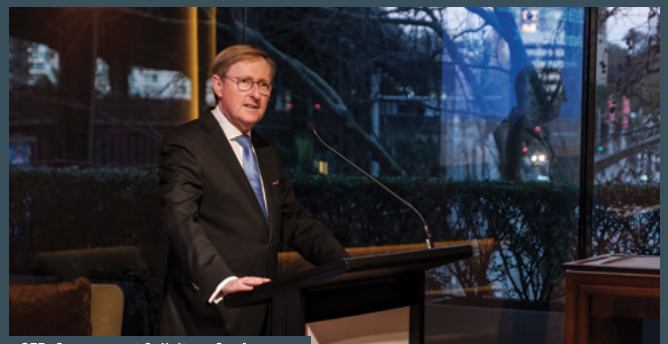
SEP: Government Solicitors Conference