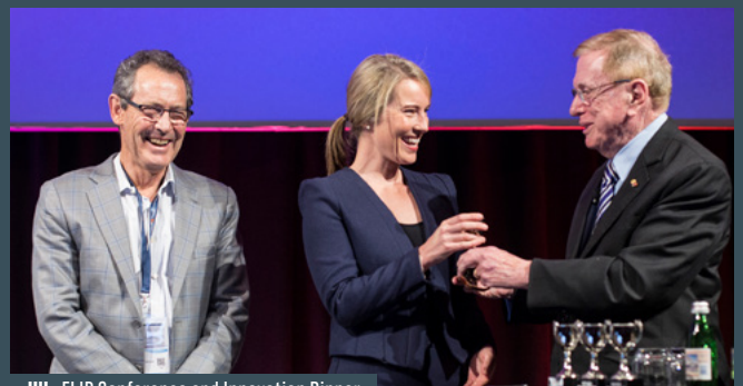
JUL: FLIP Conference and Innovation Dinner