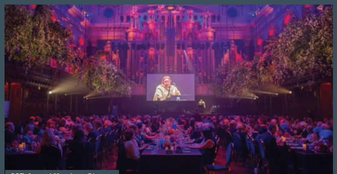
OCT: Annual Members Dinner