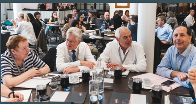
OCT: Rural Issues Conference