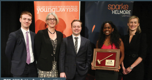
MAY: NSW Golden Gavel Competition