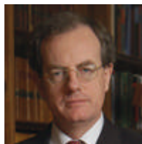
The Hon Justice Paul Le Gay Brereton

Australia's prominent position in the world economic order depends on the ability of its businesses to sell their products and expertise internationally, and to engage in cross-border ventures. This process of globalisation has also broadened the opportunities of Australians to travel, whether for business, employment, education or personal reasons. The, perhaps inevitable, result of these developments is a growth in the number of disputes before Australian courts which have a cross-border element, whether relating to the parties or the subject matter. Read more