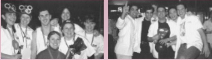
Pictured (l-r) the Henry Davis York team and the winning team PWC Legal. Both law firms were also sponsors of the event.